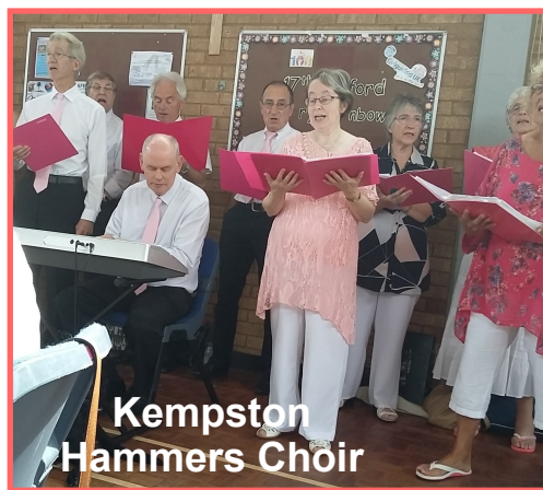
Kempston Hammers Choir