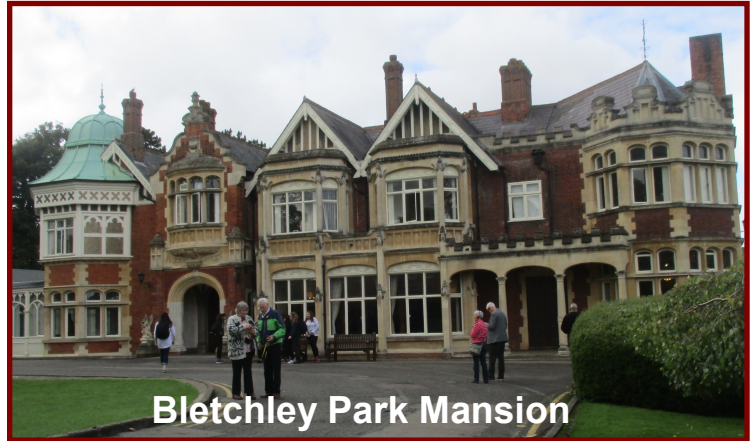
Bletchley Park Mansion