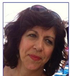
Ros Graham Committee Support