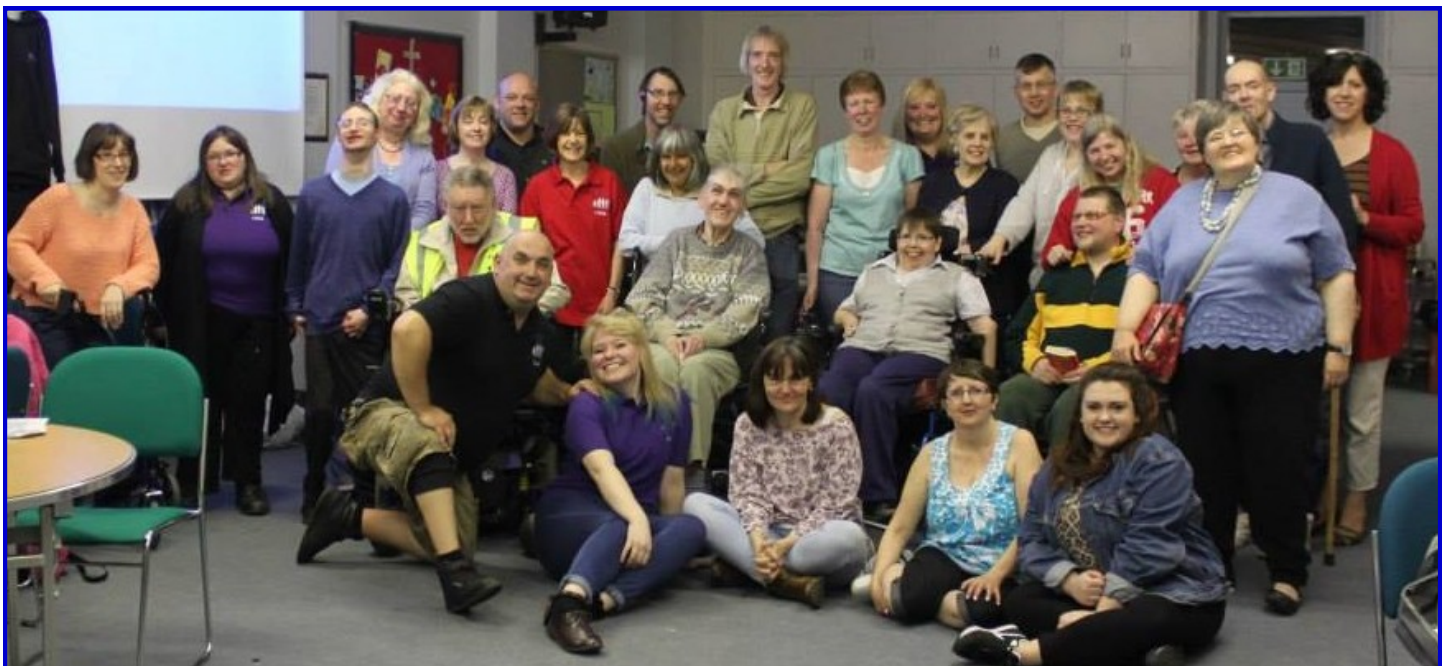
The AGM gang